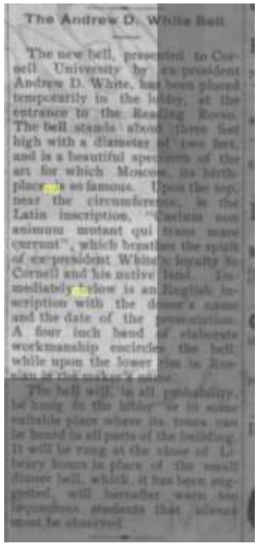
Cornell Daily Sun, XV(1), 27 Sept. 1894

From another article, a bit blurry, alas, but still legible, we learn about yet another benefaction from President White—a Russian bell, still preserved in the magnificent White Room in Uris Library: