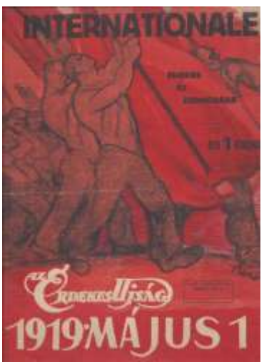
Internationale. (Budapest, 1919), music score, cover by Mihály Biró, a painter and graphic artist responsible for much of the visual culture of the Tanácsköztársaság.

This past semester, Cornell added a fifth installment to its archive of the Hungarian Soviet Republic which lasted from March 21 to April 6 of 1919, when it was crushed by a coalition of the Romanian army and Hungarian Rightists. Many of the publications of this period were subsequently destroyed by the victors, lending considerable rarity to the original photographs, drawings and publications found in this growing collection. In addition to some thirteen monographs, pamphlets and musical scores, the collection acquired original photos of